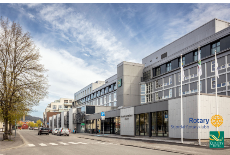
Quality Airport Hotel - Accommodation in Stjørdal