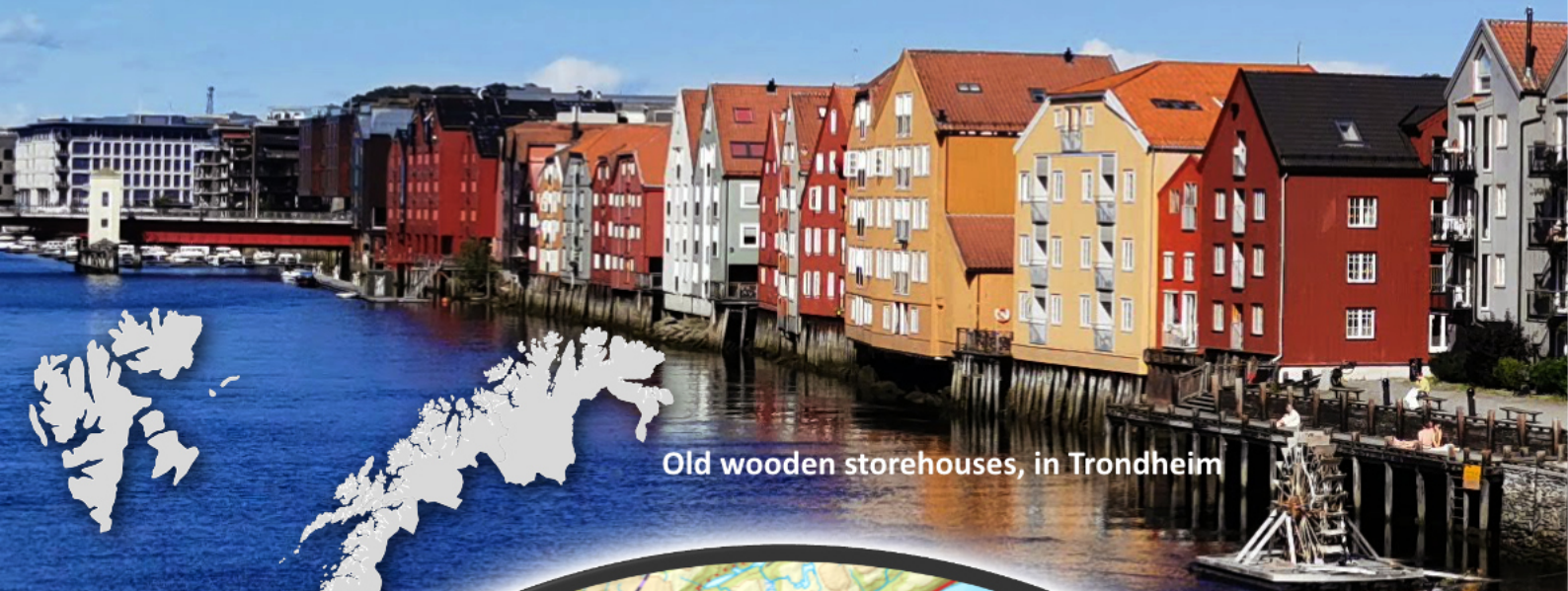
Old wooden storehouses, in Trondheim