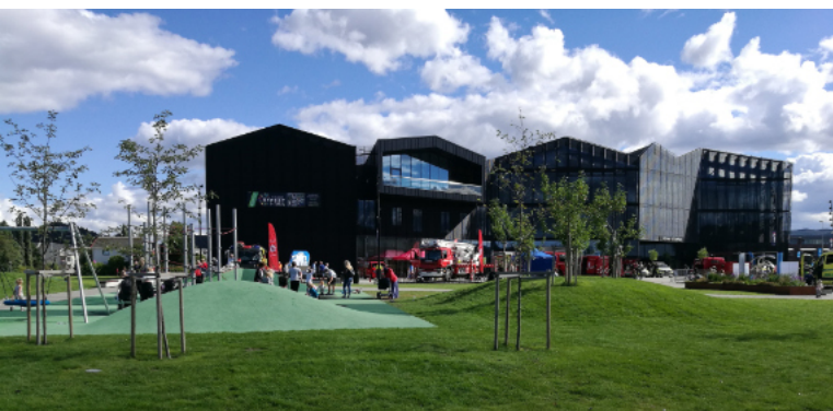
KIMEN, "The SEED" - Stjørdal cultural center

Acceptance: Applications will be considered in order of being received. Still the gender balance will be in focus